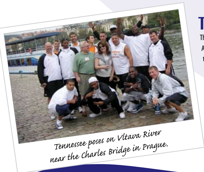
Tennessee poses on Vltava River near the Charles Bridge in Prague.