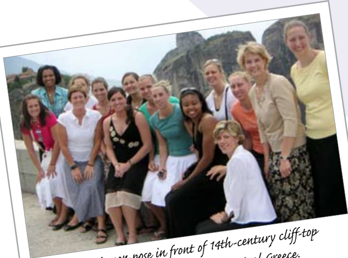
Iowa Women pose in front of 14th-century cliff-top monastery near Meteora in central Greece.