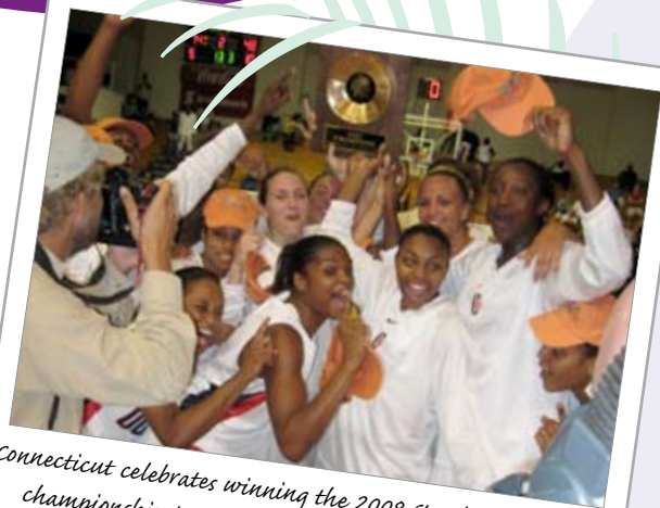
Connecticut celebrates winning the 2008 St. Thomas division championship in the strongest Paradise Jam field ever.

Call now for entry into 2009 and beyond or go to ParadiseJam.com for more details.