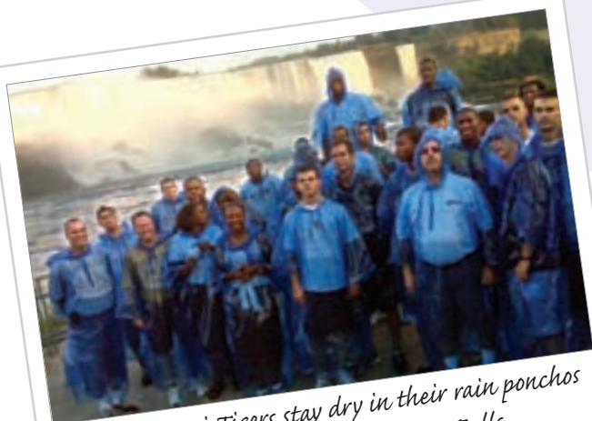
The Missouri Tigers stay dry in their rain ponchos during their visit to Niagara Falls.

In addition to playing their three games against Canadian competition, the Tigers also were able to enjoy the "Maid of the Mist" boat tour of Niagara Falls.