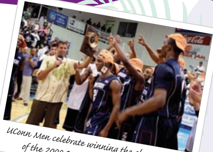
UConn Men celebrate winning the championship of the 2008 Paradise Jam.

Call now for entry into 2010 and beyond or go to ParadiseJam.com for more details.