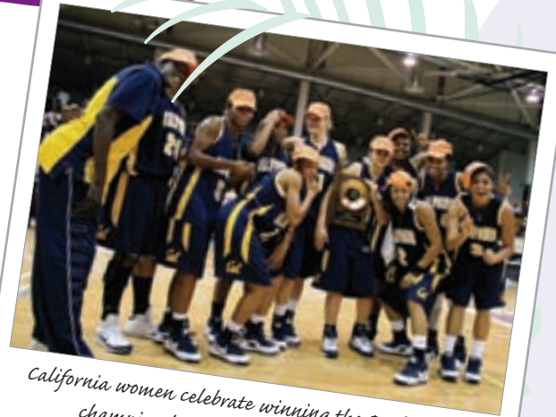
California women celebrate winning the Reef Division championship of the 2008 Paradise Jam.

Call now for entry into 2010 and beyond or go to ParadiseJam.com for more details.