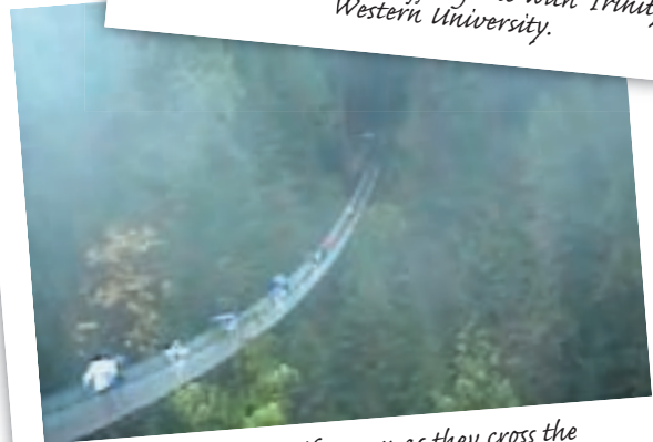
Fog envelops Pacific men as they cross the Capilano Suspension Bridge.