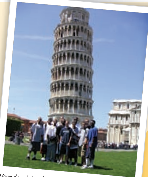
Nevada visits the Leaning Tower of Pisa in Italy