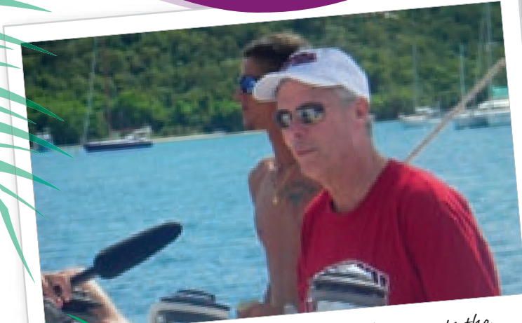
Bo Ryan steered his team to the 2005 Paradise Jam Championship.