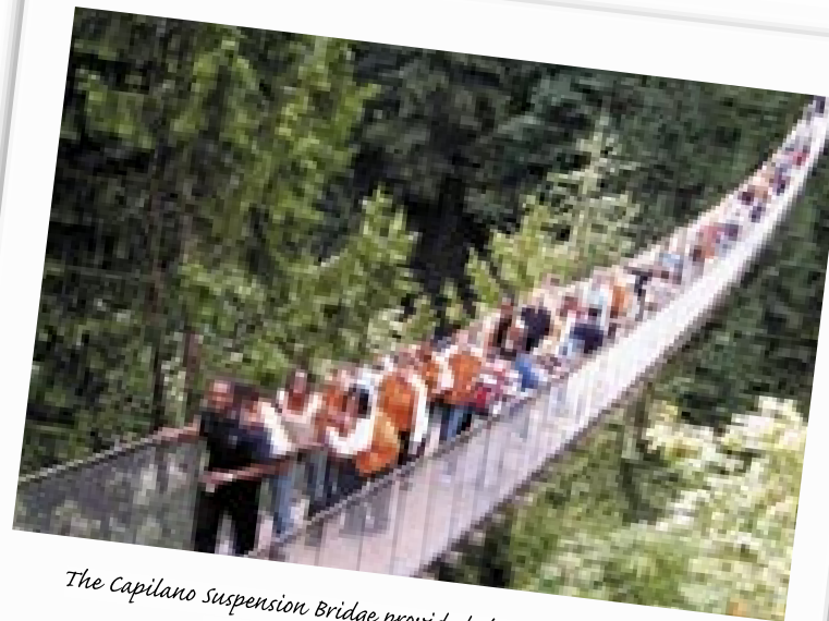
The Capilano Suspension Bridge provided the Lady Longhorns an excellent team-building experience.