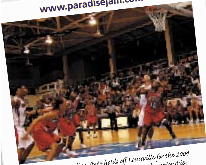
North Carolina State holds off Louisville for the 2004 Paradise Jam "St. Thomas" division championship.