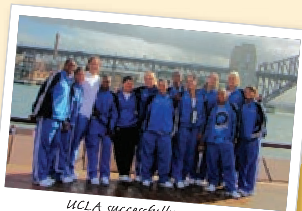
UCLA successfully masters the Sydney Harbour Bridge Climb.