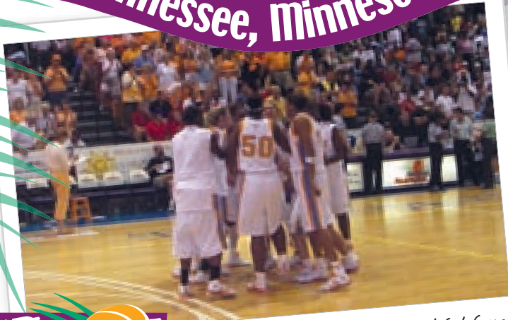
The Lady Vols and their faithful fans in orange stage a pre-game cheer.